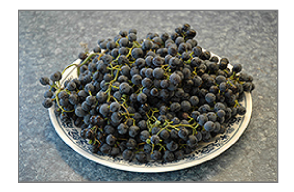
Frontenac Grape fruit

This is a dense multi-stemmed deciduous woody vine with a spreading, ground-hugging habit of growth. Its relatively coarse texture can be used to stand it apart from other landscape plants with finer foliage. This is a high maintenance plant that will require regular care and upkeep, and requires a special pruning regimen to reliably produce fruit; consult a specific reference guide or contact the store for proper pruning techniques. It is a good choice for attracting birds to your yard. Gardeners should be aware of the following characteristic(s) that may warrant special consideration;