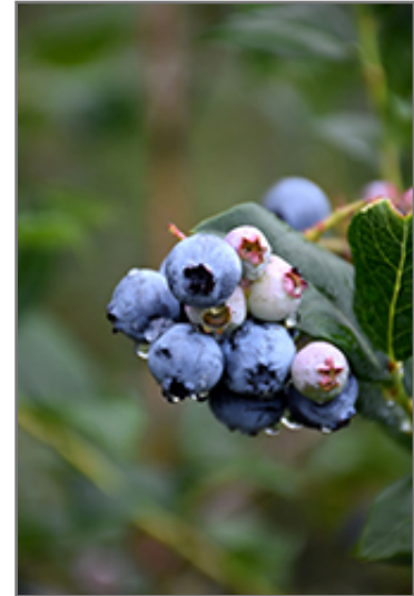
Chippewa Blueberry fruit

Chippewa Blueberry features dainty clusters of white bell-shaped flowers with shell pink overtones hanging below the branches in mid spring. It has green deciduous foliage. The glossy oval leaves turn an outstanding orange in the fall. It features an abundance of magnificent blue berries in mid summer.