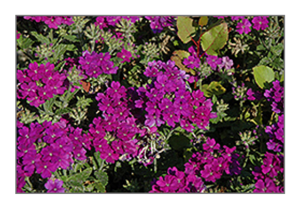
Lanai Blue Verbena flowers