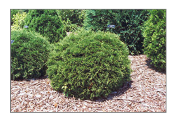
Hetz Midget Arborvitae

Hetz Midget Arborvitae will grow to be about 24 inches tall at maturity, with a spread of 3 feet. It tends to fill out right to the ground and therefore doesn't necessarily require facer plants in front. It grows at a slow rate, and under ideal conditions can be expected to live for approximately 30 years.