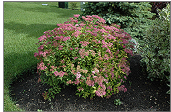
Goldflame Spirea in bloom