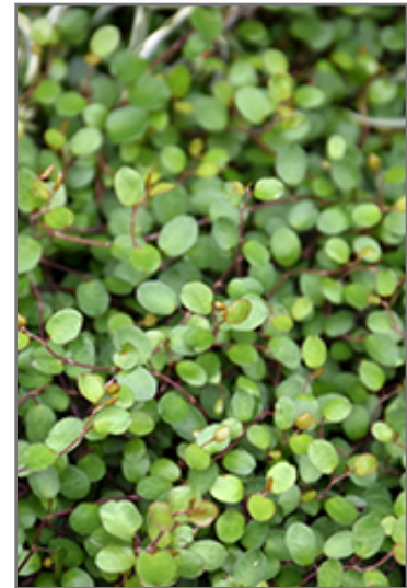
Creeping Wire Vine foliage