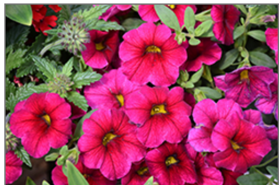
Superbells Cherry Red Calibrachoa flowers