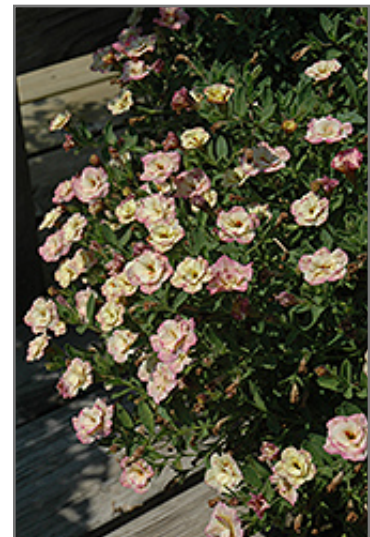
MiniFamous Double Rose Chai Calibrachoa flowers