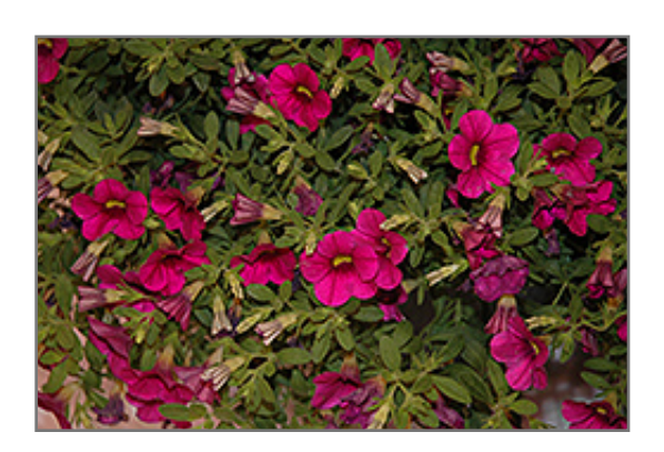
Million Bells Cherry Pink Calibrachoa flowers

Free flowering with a compact trailing habit, this series is ideal for hanging baskets, patio containers, beds and borders; continuous blooming from late spring to autumn; low maintenance and easy to grow