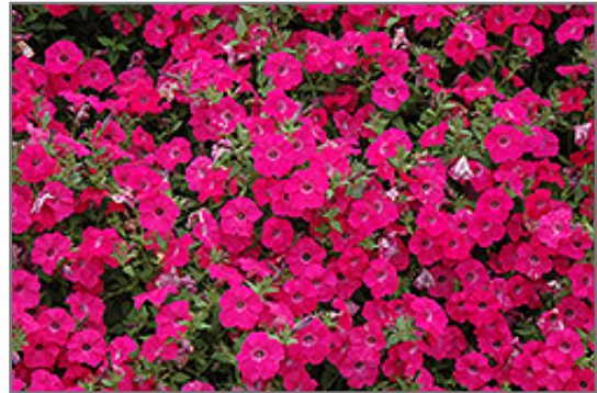
Tidal Wave Hot Pink Petunia in bloom