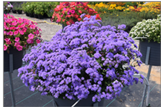
Artist Blue Flossflower in bloom