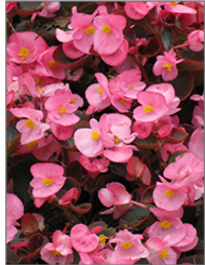
Bada Boom Pink Begonia flowers