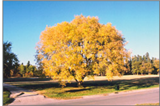
Boxelder in fall