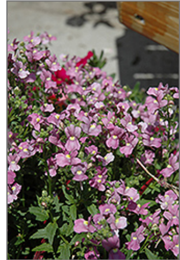
Compact Pink Innocence Nemesia flowers