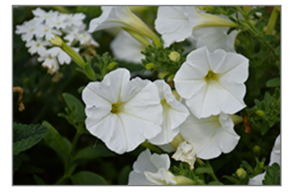
Supertunia White Petunia flowers