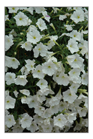
Supertunia White Petunia flowers