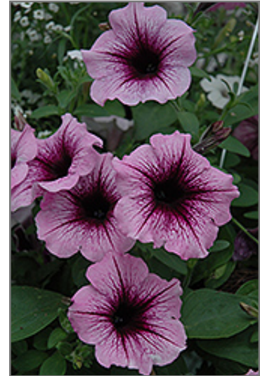
Supertunia Bordeaux Petunia flowers