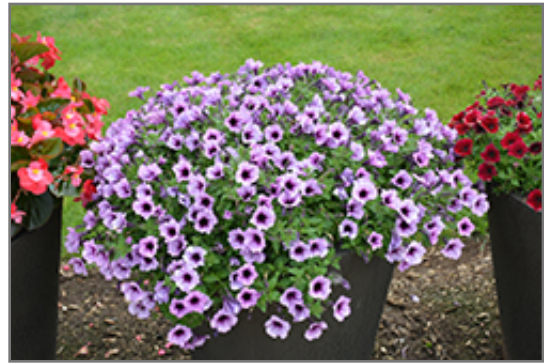
Supertunia Bordeaux Petunia in bloom

Supertunia Bordeaux Petunia is a fine choice for the garden, but it is also a good selection for planting in outdoor containers and hanging baskets. Because of its trailing habit of growth, it is ideally suited for use as a 'spiller' in the 'spiller-thriller-filler' container combination; plant it near the edges where it can spill gracefully over the pot. Note that when growing plants in outdoor containers and baskets, they may require more frequent waterings than they would in the yard or garden.