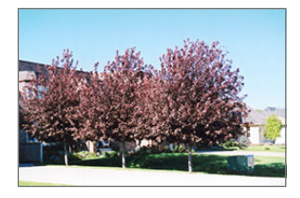
Schubert Chokecherry

Schubert Chokecherry is a deciduous tree with a more or less rounded form. Its average texture blends into the landscape, but can be balanced by one or two finer or coarser trees or shrubs for an effective composition.