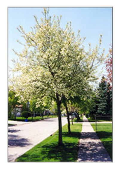
Schubert Chokecherry in bloom