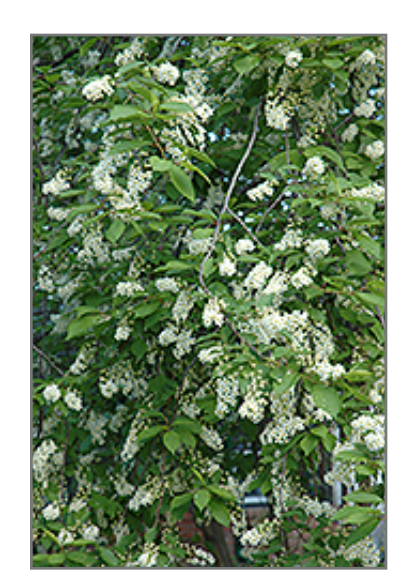
Schubert Chokecherry flowers

Schubert Chokecherry will grow to be about 25 feet tall at maturity, with a spread of 20 feet. It has a low canopy with a typical clearance of 4 feet from the ground, and is suitable for planting under power lines. It grows at a medium rate, and under ideal conditions can be expected to live for 40 years or more. This is a self-pollinating variety, so it doesn't require a second plant nearby to set fruit.