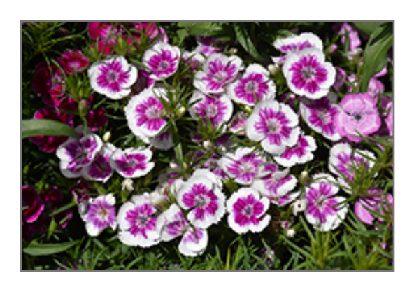
Wee Willie Sweet William flowers