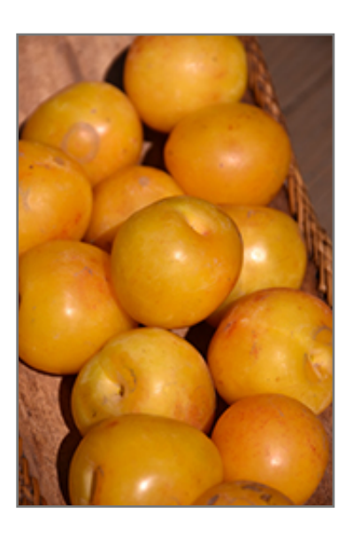
Brookgold Plum fruit