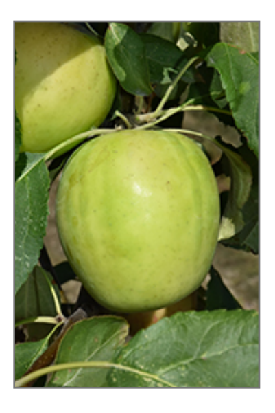
Norkent Apple fruit

Norkent Apple features showy clusters of lightly-scented white flowers with shell pink overtones along the branches in mid spring, which emerge from distinctive pink flower buds. It has forest green deciduous foliage. The pointy leaves turn yellow in fall. The fruits are showy light green apples with scarlet stripes, which are carried in abundance in late summer. The fruit can be messy if allowed to drop on the lawn or walkways, and may require occasional clean-up.