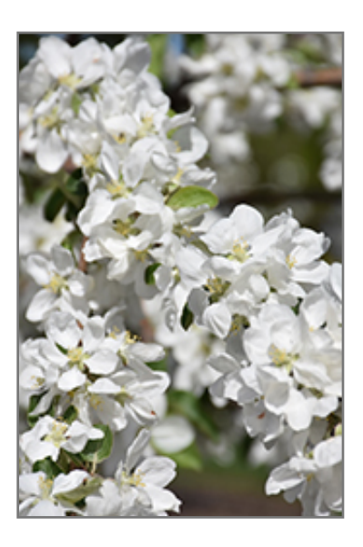
Norkent Apple flowers