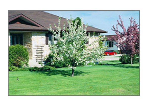
Norkent Apple in bloom

This tree is typically grown in a designated area of the yard because of its mature size and spread. It should only be grown in full sunlight. It prefers to grow in average to moist conditions, and shouldn't be allowed to dry out. It is not particular as to soil type or pH. It is highly tolerant of urban pollution and will even thrive in inner city environments. This particular variety is an interspecific hybrid.