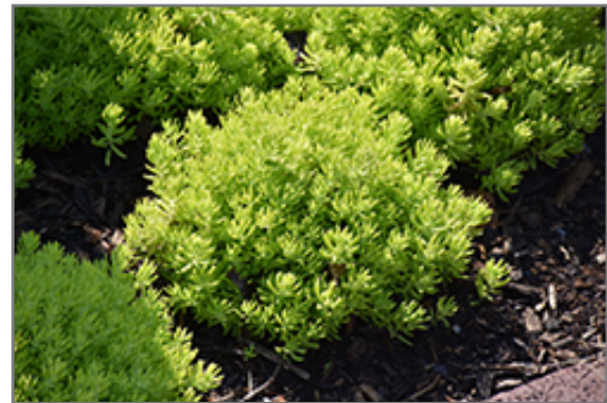
Lemon Coral Stonecrop