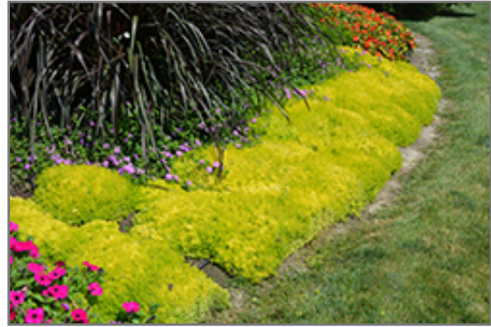
Lemon Coral Stonecrop

At Dutch Growers, we treat this plant as a "HOBBY PLANT". It is not officially recognized as winter-hardy in our zone 3, however, there is a strong likelihood that it will survive winter. Warranty expires on Nov. 1 season of purchase.