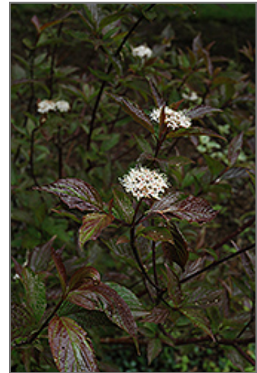
Kesselring Dogwood flowers

Kesselring Dogwood will grow to be about 6 feet tall at maturity, with a spread of 6 feet. It tends to fill out right to the ground and therefore doesn't necessarily require facer plants in front, and is suitable for planting under power lines. It grows at a fast rate, and under ideal conditions can be expected to live for approximately 20 years.