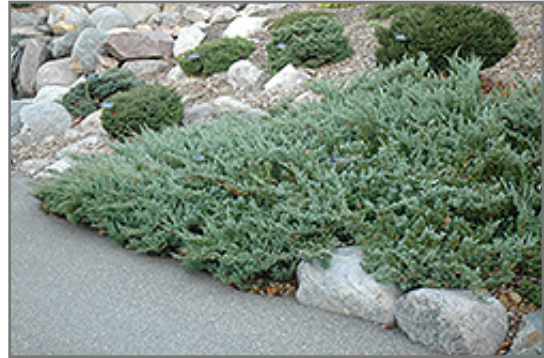
Hughes Juniper

Hughes Juniper will grow to be about 12 inches tall at maturity, with a spread of 8 feet. It tends to fill out right to the ground and therefore doesn't necessarily require facer plants in front. It grows at a slow rate, and under ideal conditions can be expected to live for approximately 30 years.