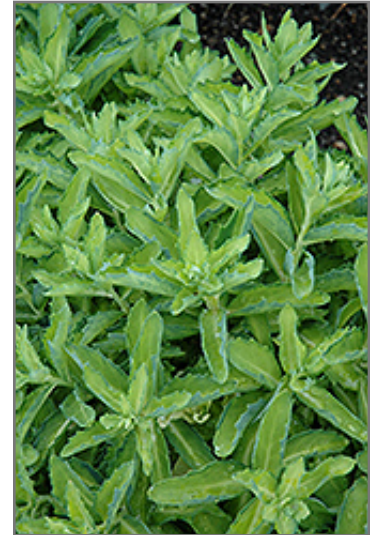
Autumn Delight Stonecrop foliage

Autumn Delight Stonecrop is a fine choice for the garden, but it is also a good selection for planting in outdoor pots and containers. It is often used as a 'filler' in the 'spiller-thriller-filler' container combination, providing a mass of flowers and foliage against which the larger thriller plants stand out. Note that when growing plants in outdoor containers and baskets, they may require more frequent waterings than they would in the yard or garden. Be aware that in our climate, most plants cannot be expected to survive the winter if left in containers outdoors, and this plant is no exception. Contact our experts for more information on how to protect it over the winter months.