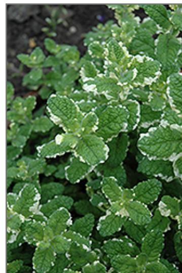
Variegated Pineapple Mint foliage

Variegated Pineapple Mint will grow to be about 18 inches tall at maturity extending to 24 inches tall with the flowers, with a spread of 24 inches. Its foliage tends to remain dense right to the ground, not requiring facer plants in front. Although it's not a true annual, this fast-growing plant can be expected to behave as an annual in our climate if left outdoors over the winter, usually needing replacement the following year. As such, gardeners should take into consideration that it will perform differently than it would in its native habitat.