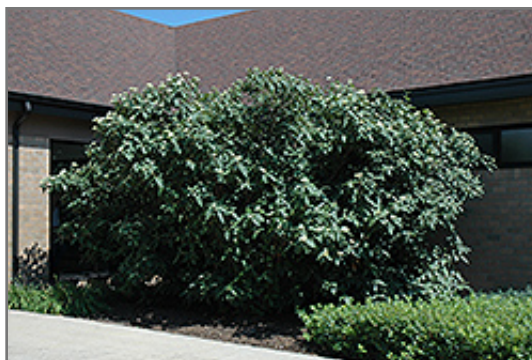
Wayfaring Tree