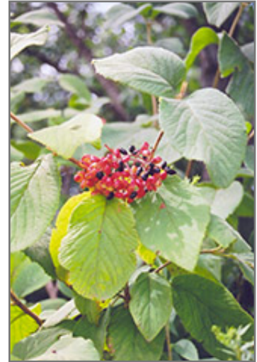
Wayfaring Tree fruit

This shrub does best in full sun to partial shade. It is very adaptable to both dry and moist locations, and should do just fine under average home landscape conditions. It is not particular as to soil type or pH. It is highly tolerant of urban pollution and will even thrive in inner city environments. This species is not originally from North America.