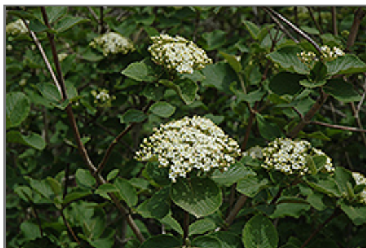
Wayfaring Tree flowers

This is a relatively low maintenance shrub, and should only be pruned after flowering to avoid removing any of the current season's flowers. It is a good choice for attracting birds to your yard, but is not particularly attractive to deer who tend to leave it alone in favor of tastier treats. It has no significant negative characteristics.