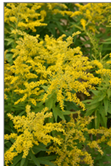
Golden Baby Goldenrod flowers

This plant will require occasional maintenance and upkeep, and is best cleaned up in early spring before it resumes active growth for the season. It is a good choice for attracting butterflies to your yard, but is not particularly attractive to deer who tend to leave it alone in favor of tastier treats. Gardeners should be aware of the following characteristic(s) that may warrant special consideration;