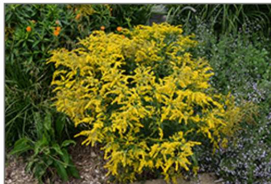
Golden Baby Goldenrod in bloom