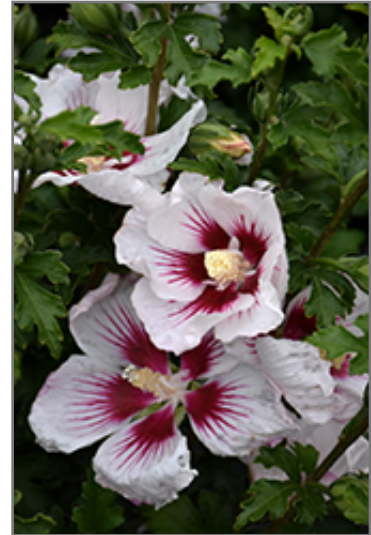
Chateau de Chantilly Rose of Sharon flowers

Chateau de Chantilly Rose of Sharon is recommended for the following landscape applications;