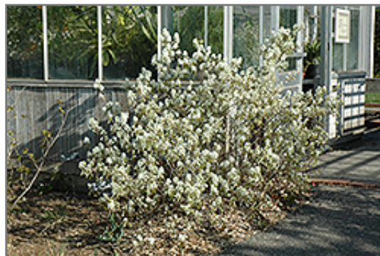
Regent Saskatoon flowers