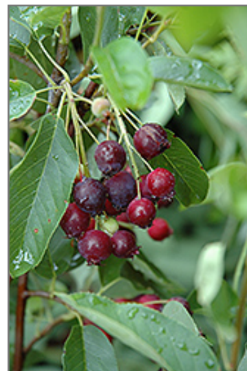
Regent Saskatoon fruit

Regent Saskatoon is blanketed in stunning clusters of white flowers rising above the foliage from early to mid spring before the leaves. It has dark green deciduous foliage. The oval leaves turn an outstanding yellow in the fall. It features an abundance of magnificent blue berries from late spring to early summer.