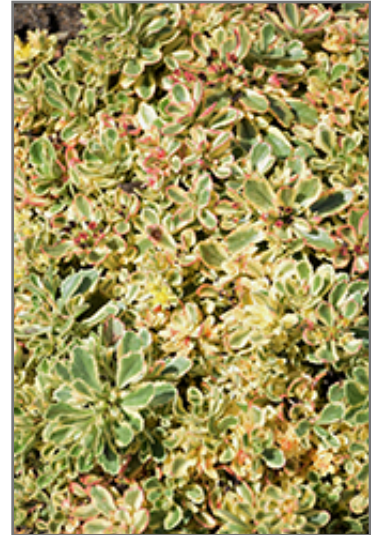
Rock 'N Low Boogie Woogie Stonecrop foliage

Rock 'N Low Boogie Woogie Stonecrop is a fine choice for the garden, but it is also a good selection for planting in outdoor pots and containers. It is often used as a 'filler' in the 'spiller-thriller-filler' container combination, providing a mass of flowers and foliage against which the thriller plants stand out. Note that when growing plants in outdoor containers and baskets, they may require more frequent waterings than they would in the yard or garden. Be aware that in our climate, most plants cannot be expected to survive the winter if left in containers outdoors, and this plant is no exception. Contact our experts for more information on how to protect it over the winter months.