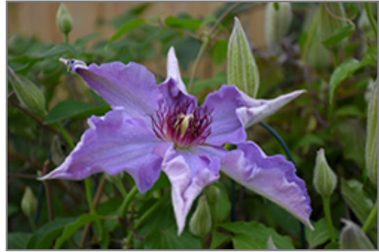
Little Duckling Clematis flowers