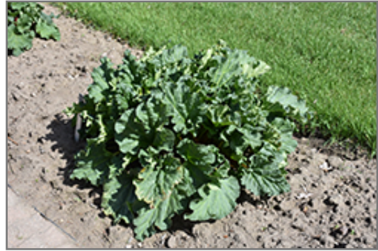
Glaskin's Perpetual Rhubarb

Glaskin's Perpetual Rhubarb features bold spikes of cherry red flowers rising above the foliage from early to mid summer, which emerge from distinctive chartreuse flower buds. Its enormous crinkled round leaves remain green in colour throughout the season. The cherry red stems are very colorful and add to the overall interest of the plant.