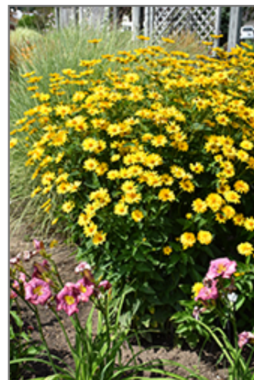
Summer Sun False Sunflower in bloom