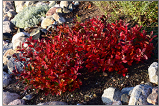
Low Scape Mound Aronia in fall

Low Scape Mound Aronia makes a fine choice for the outdoor landscape, but it is also well-suited for use in outdoor pots and containers. It can be used either as 'filler' or as a 'thriller' in the 'spiller-thriller-filler' container combination, depending on the height and form of the other plants used in the container planting. It is even sizeable enough that it can be grown alone in a suitable container. Note that when grown in a container, it may not perform exactly as indicated on the tag - this is to be expected. Also note that when growing plants in outdoor containers and baskets, they may require more frequent waterings than they would in the yard or garden. Be aware that in our climate, most plants cannot be expected to survive the winter if left in containers outdoors, and this plant is no exception. Contact our experts for more information on how to protect it over the winter months.