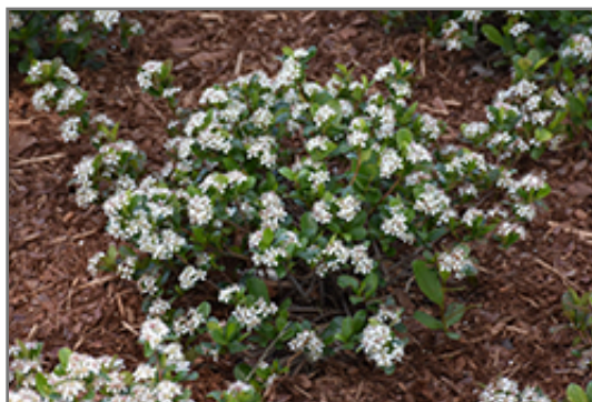
Low Scape Mound Aronia in bloom