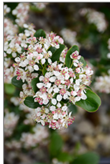
Low Scape Mound Aronia flowers