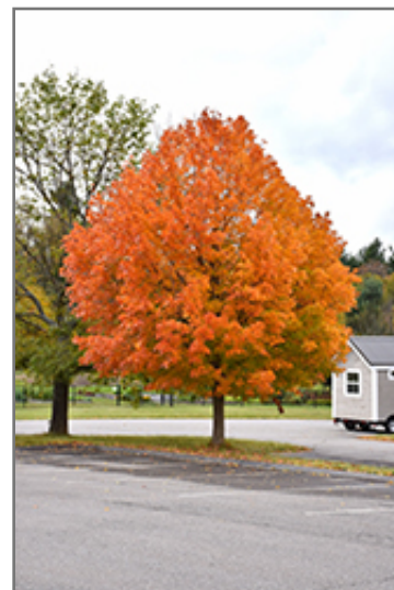
Sugar Maple in fall