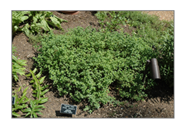
Greek Oregano

Greek Oregano will grow to be about 16 inches tall at maturity extending to 24 inches tall with the flowers, with a spread of 14 inches. When grown in masses or used as a bedding plant, individual plants should be spaced approximately 12 inches apart. Its foliage tends to remain dense right to the ground, not requiring facer plants in front. Although it's not a true annual, this fast-growing plant can be expected to behave as an annual in our climate if left outdoors over the winter, usually needing replacement the following year. As such, gardeners should take into consideration that it will perform differently than it would in its native habitat.