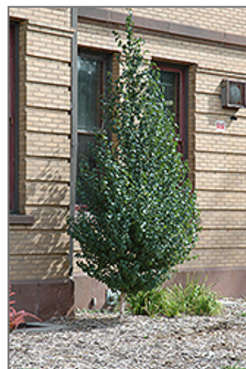
Dakota Pinnacle Japanese White Birch