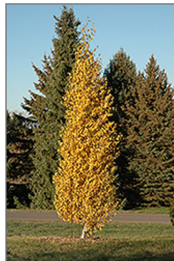
Dakota Pinnacle Japanese White Birch in fall