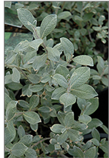
Polar Bear Willow foliage