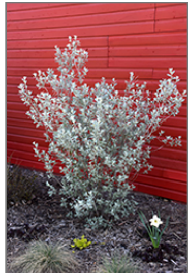
Polar Bear Willow