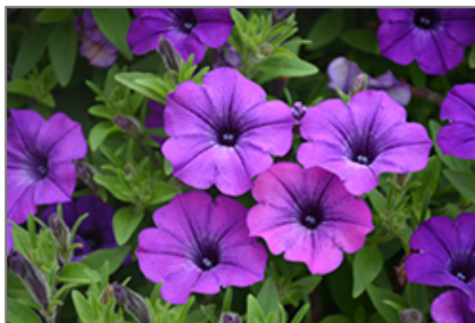
Supertunia Indigo Charm Petunia flowers