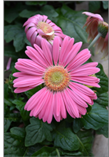
Pink Gerbera Daisy flowers

Lovely pink daisies with yellow centers rise above sea green foliage on this upright variety; perfect for garden beds, borders and containers; excellent in cut-flower arrangements; adaptable as a houseplant