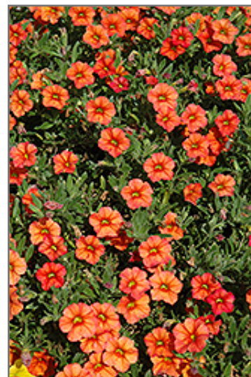
Million Bells Crackling Fire Calibrachoa flowers

Free flowering with a compact trailing habit, this series is ideal for hanging baskets, patio containers, beds and borders; continuous blooming from late spring to autumn; low maintenance and easy to grow