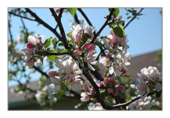
Goodland Apple flowers