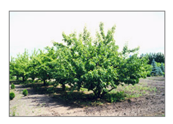
Goodland Apple

This tree is typically grown in a designated area of the yard because of its mature size and spread. It should only be grown in full sunlight. It prefers to grow in average to moist conditions, and shouldn't be allowed to dry out. It is not particular as to soil type or pH. It is highly tolerant of urban pollution and will even thrive in inner city environments. This particular variety is an interspecific hybrid.