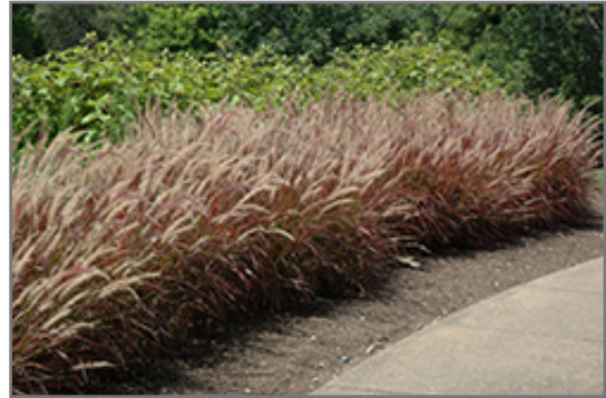
Purple Fountain Grass in bloom

Purple Fountain Grass will grow to be about 4 feet tall at maturity, with a spread of 3 feet. Although it's not a true annual, this plant can be expected to behave as an annual in our climate if left outdoors over the winter, usually needing replacement the following year. As such, gardeners should take into consideration that it will perform differently than it would in its native habitat.