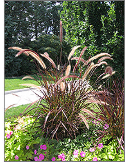
Purple Fountain Grass flowers

Purple Fountain Grass is recommended for the following landscape applications;