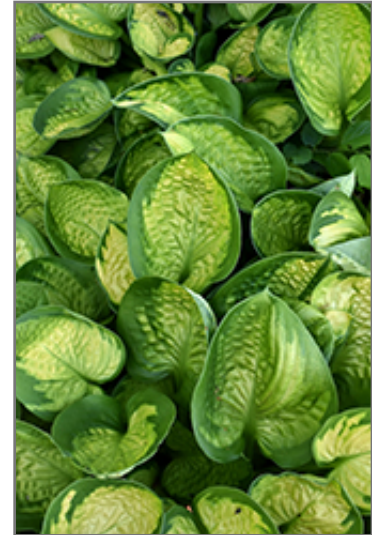
Rainforest Sunrise Hosta foliage

Rainforest Sunrise Hosta is recommended for the following landscape applications;