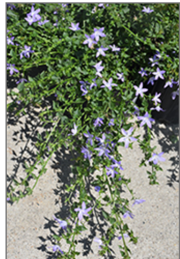
Blue Waterfall Serbian Bellflower in bloom