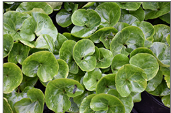
European Wild Ginger foliage