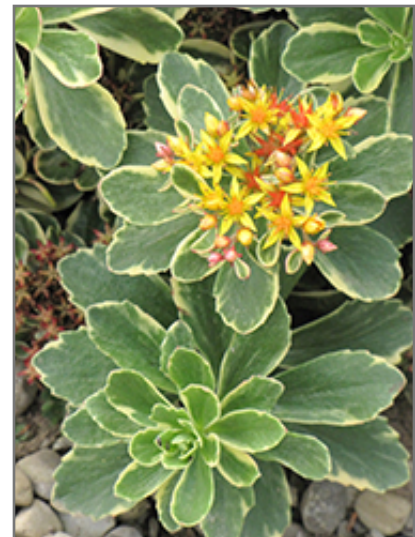
Variegated Russian Stonecrop flowers