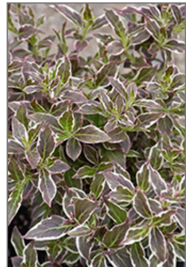
My Monet Purple Effect Weigela foliage