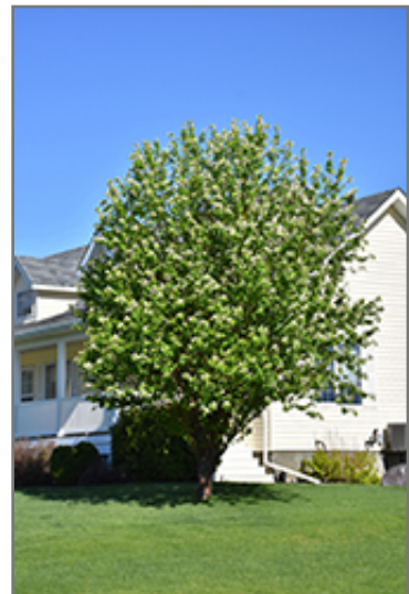
Amur Cherry