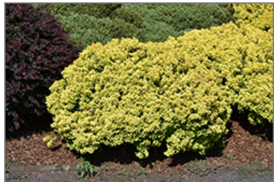
Golden Nugget Japanese Barberry